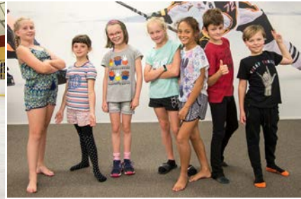
28 skaters attended the main camp and 10 skaters the “junior” camp in Dunedin