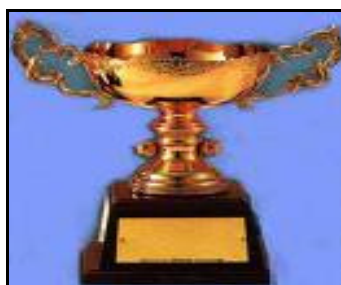
Overall 3 rd /6

Elementary Ladies (11 years and under) Preeya Laud – FS 3 rd /6